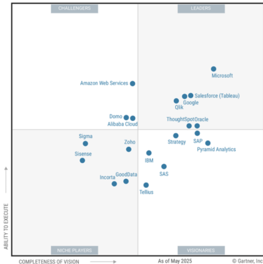
Fig. 1 Magic Quadrant for Analytics and Business Intelligence Platforms

market, without being treated as a complete validation for all implementation scenarios [10, 11, 12].