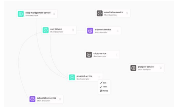
Fig. 3. Dashboard diagram

configurational utilities come together to provide users with the resources they need so that at the end could have a fully functional project. As new microservices are created, users can attach detailed notes to each one, documenting specific functionalities and architectural decisions. This ensures that each microservice's role and configuration are understood clearly and maintained through the project lifecycle.