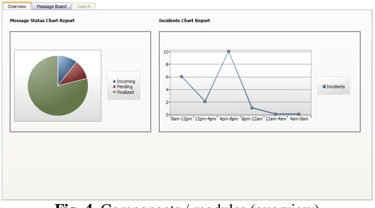
Fig. 4. Components / modules (overview)