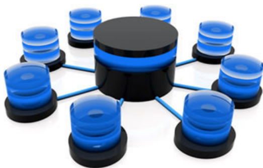
Fig. 1. Database schema

Through the execution of a database quality control, it can be optimized without duplicates and with high integrity.